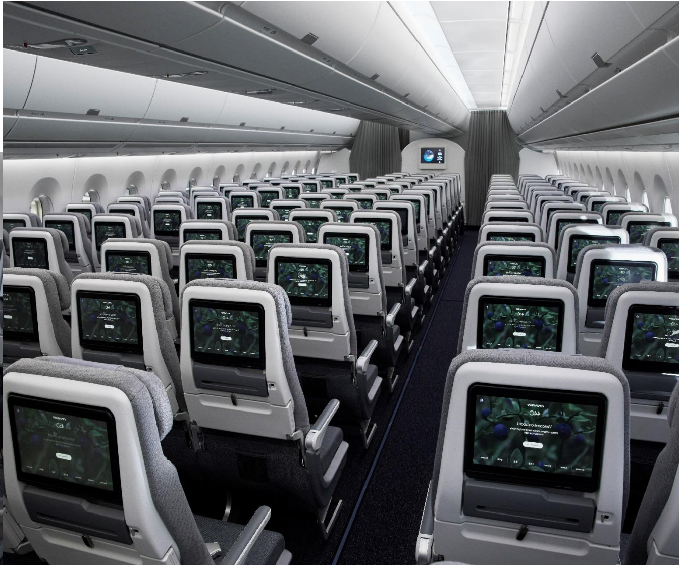
Airbus A330 & A350 aircraft