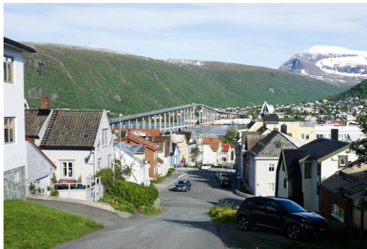
Tromsø (via Rovaniemi)